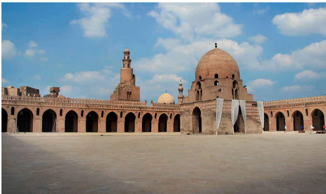
Fig. 6: The Mosque of Ibn Tulun in Cairo (Egypt), built between 262 A.H. / 876 C.E. and 265 A.H. / 879 C.E. with the Mamluk ablution fountain of the 7 th century A.H. / late 13 th century C.E.