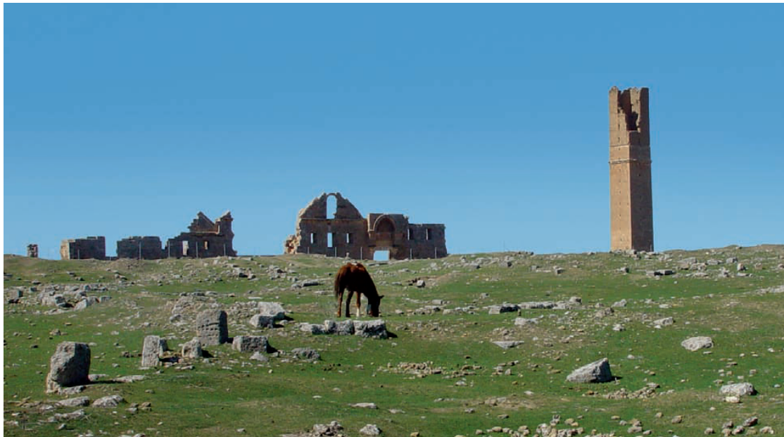
Fig. 2: The Mosque of Harran (Turkey), in what was once the last residential city of the Umayyads, today a romantic

Fig. 1: The suq of Aleppo (Syria), before its destruction, walking on the Hellenistic and Roman city plan in the Suq al-Jumruk of the 10 th century A.H. / 16 th century C.E.