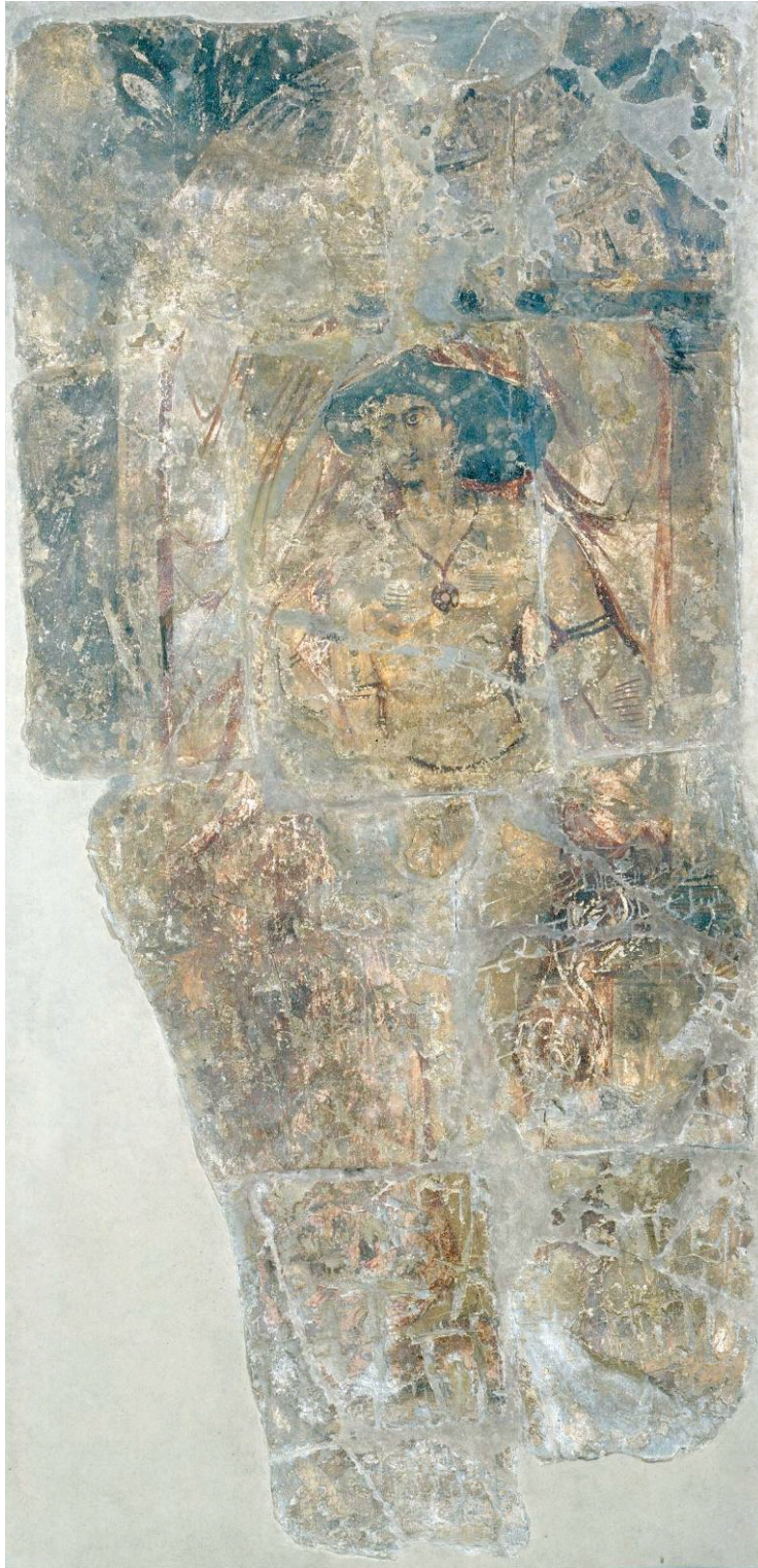
Female Figure (I. 1264), Museum of Islamic Art – Berlin